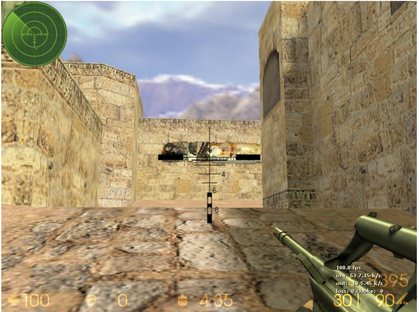
Gta Vice City Bangla Version